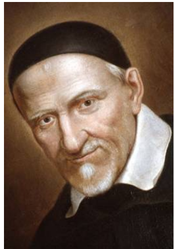
St Vincent de Paul: A Person of the 17th Century A Person for the 21st Century

He turned his sense of frustration and dissatisfaction into an urgent faith-filled desire to do as much good as he could, as well as he could, to reach out to improve the lives of the people whose gazes he returned so intently and whose suffering moved him so personally.